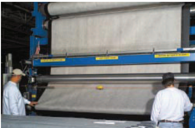
Exclusive equipment in Carlisle, PA produces FleeceBACK membranes with factory-applied tape.

Attendees participate in a one-day, hands-on workshop learning about FleeceBACK membranes, adhesive and accessories, followed up with on-site training for all contractors.